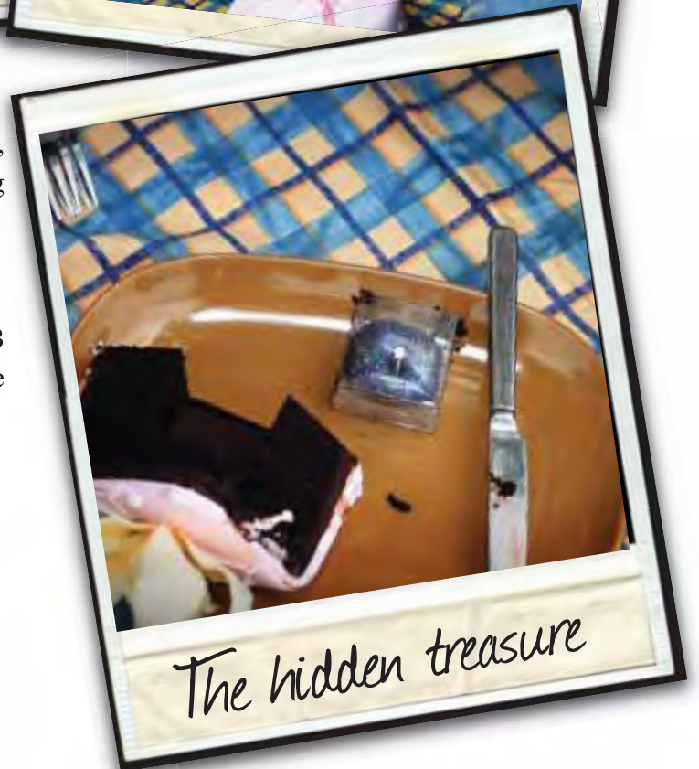
The hidden treasure

Sweetheart, will you marry me Spend eternity by my side Baby, will you give your heart Never be apart As my wife