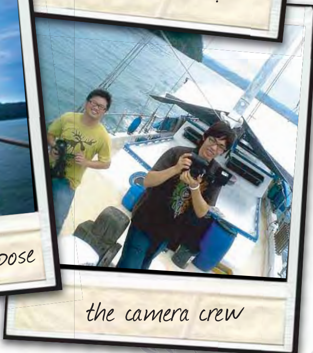
the camera crew