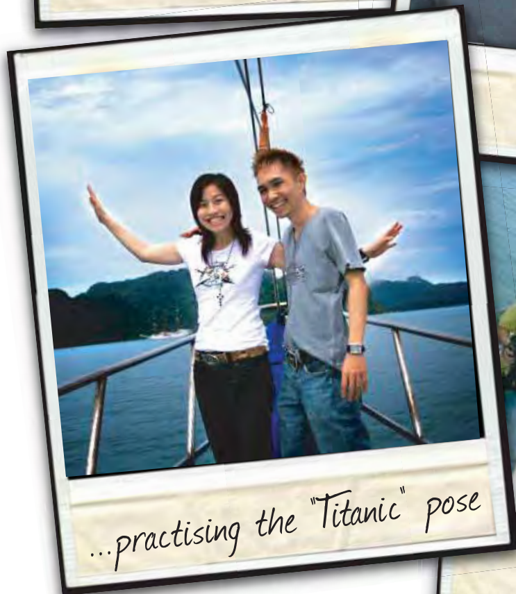
...practising the "Titanic" pose